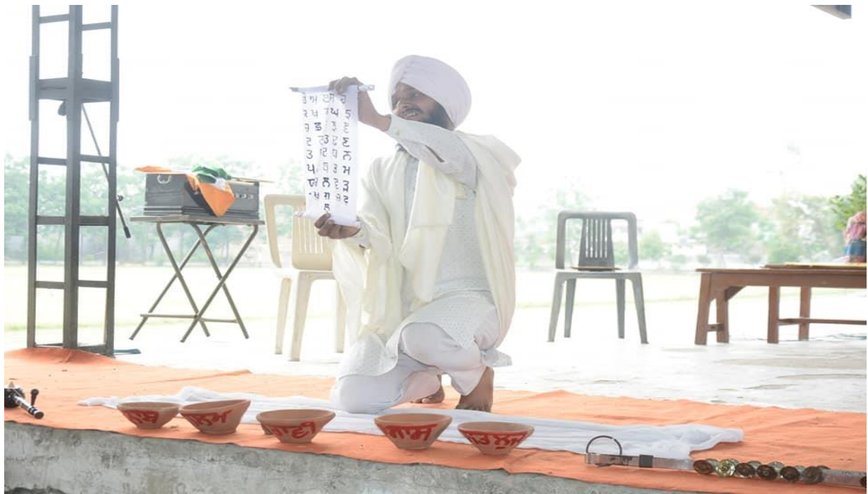
Solo Play titled "ਮਾਂ ਦੀ ਭਾਸ਼ਾ" On the Theme Punjabi - Mother Tongue