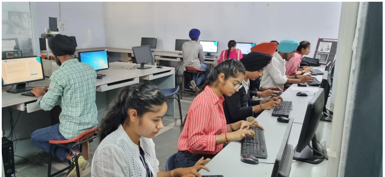
Mindsweeper Program organized by Department of Computer Science on 05 May, 2022