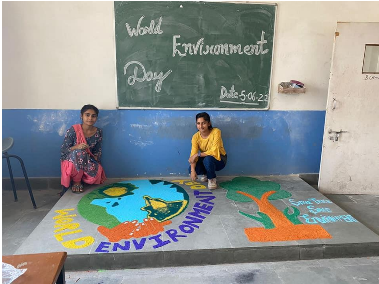
Students participated in World Environment Day on June 5, 2022