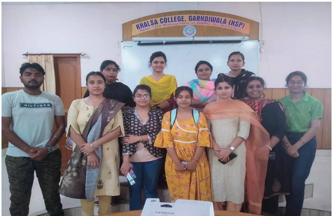
Students and Teachers celebrating 'National Technology Day' On May 11, 22