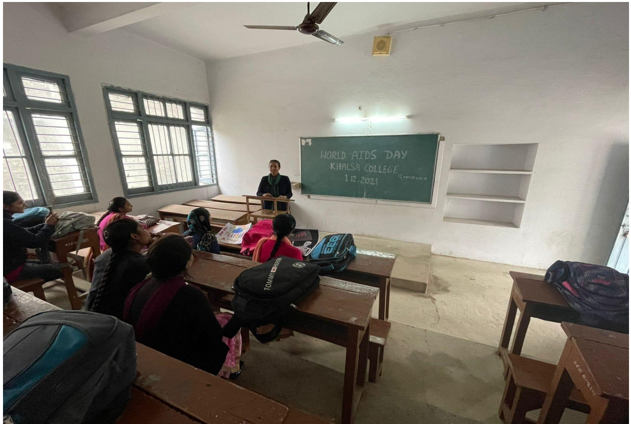
Poster making competition on World's Aids Day, 01 December, 2021