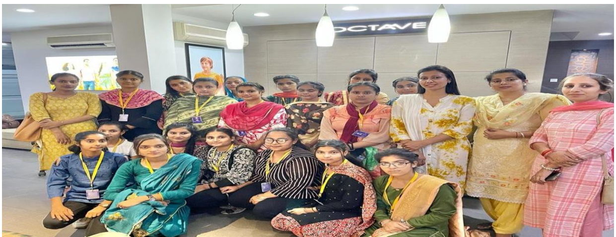
Industrial Visit of B. Sc. (Fashion Designing) students at Octave Apparels Ludhiana on April 4, 2022