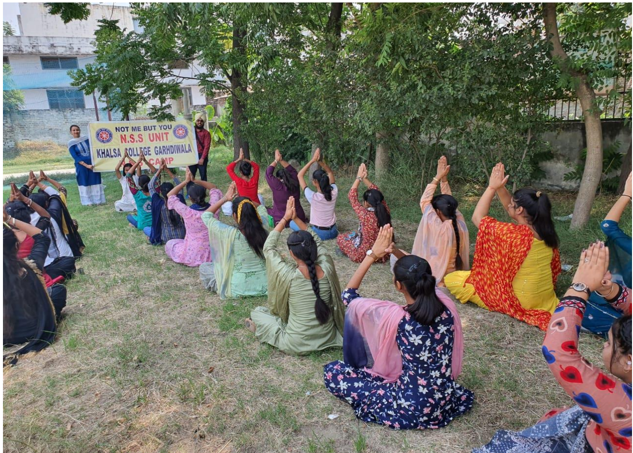
Students doing Yoga on International Yoga Day, June 21, 2022