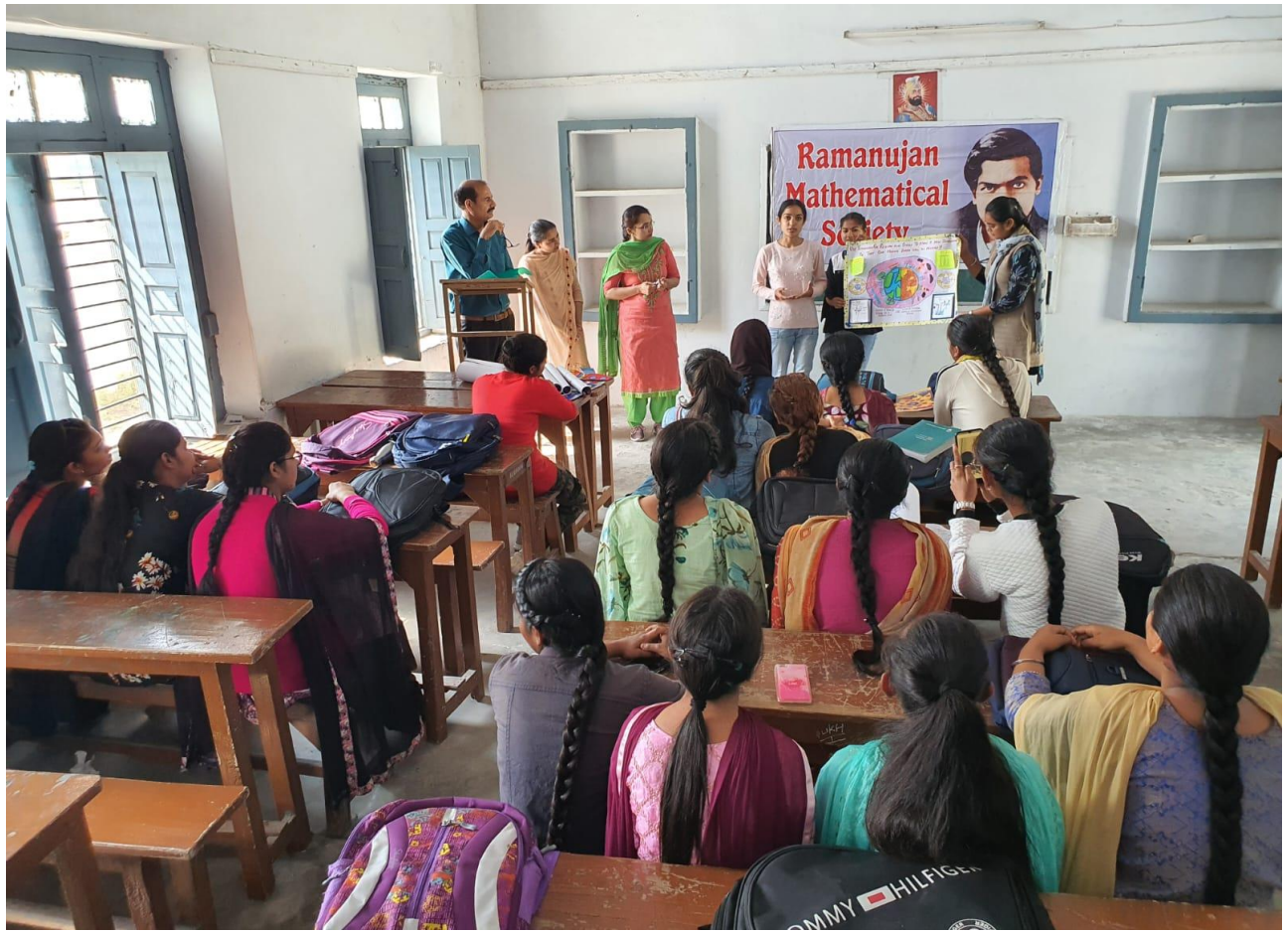
Students participating in Intercollege Poster Making Competition at JCDAV, Dasuya on March 15, 2022