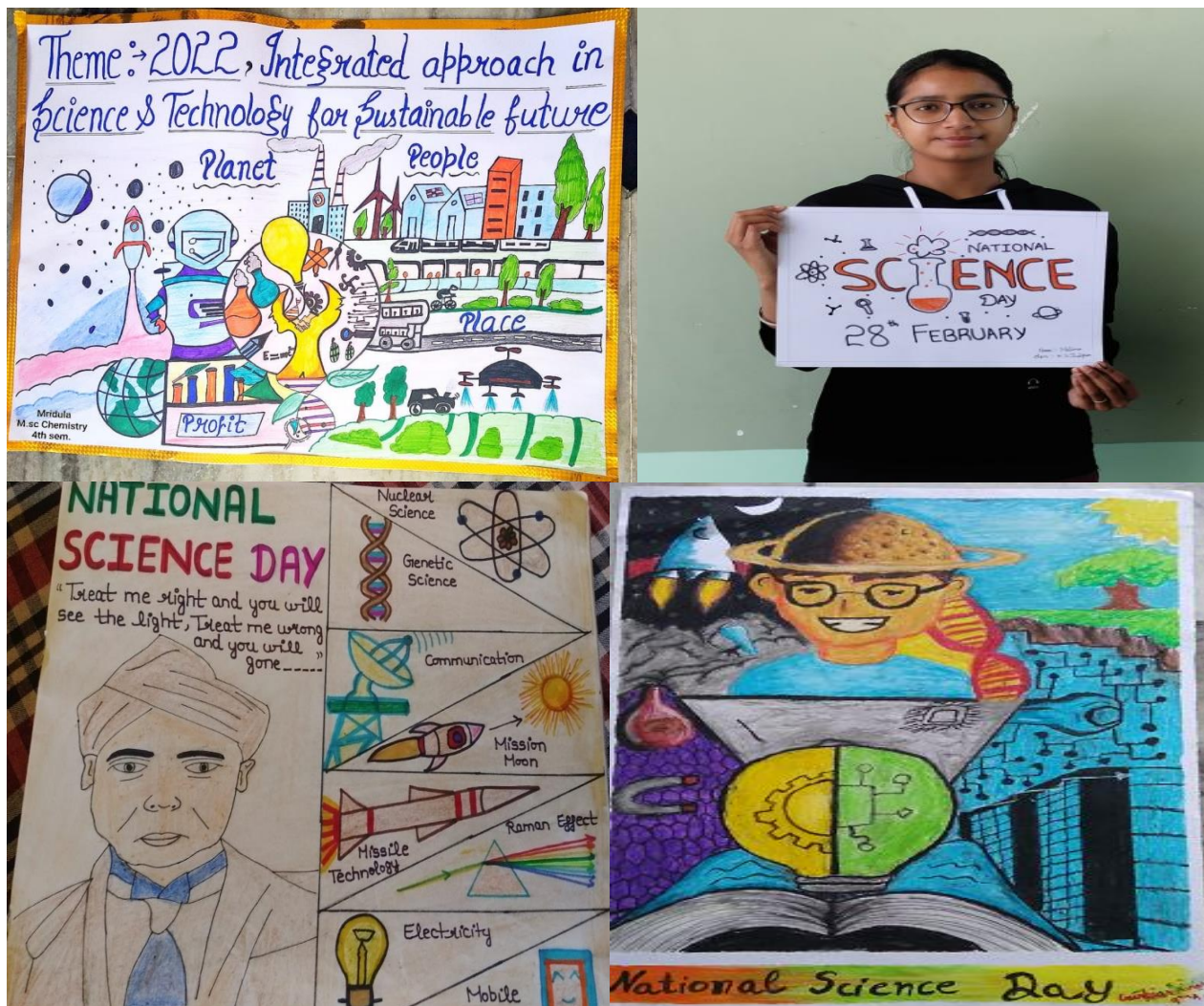
Poster making competition organized by Department of Chemistry on the occasion of "National Science Day" 28 February 2022

participated in this event. 'Integrated Approach in Science and Technology for Sustainable Future' was the theme of the "World Science Day."